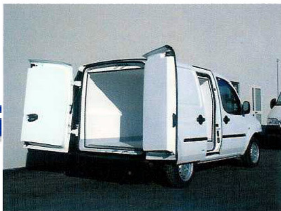
Fiat Scudo : volum 4-6 mc