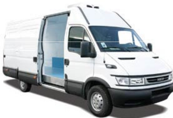
Iveco Daily: volum 12-17 mc