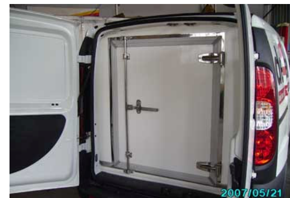
Fiat Doblo :volum 2-4 mc