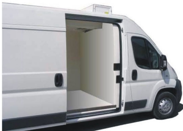
Fiat Ducato : volum 9-17 mc